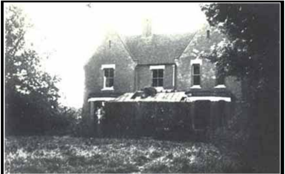
The Borley Rectory in June of 1937. Price rented the home during this time to conduct large-scale investigations.