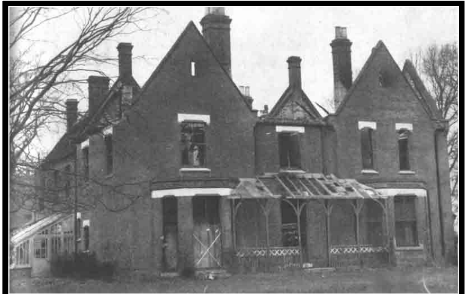
The Borley Rectory ruins one month after the March 1939 fire.