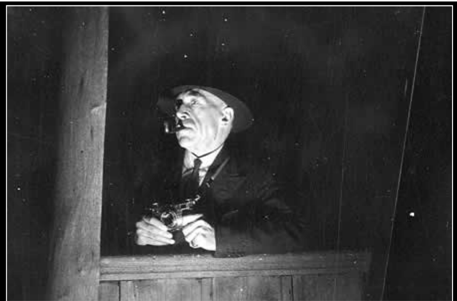
Harry Price watching for the ghostly nun at Borley Rectory.

But was Borley really haunted? The jury is still out. Shortly after Price's death, several members of the Society for Psychological Research, including two men who were close to Price, came