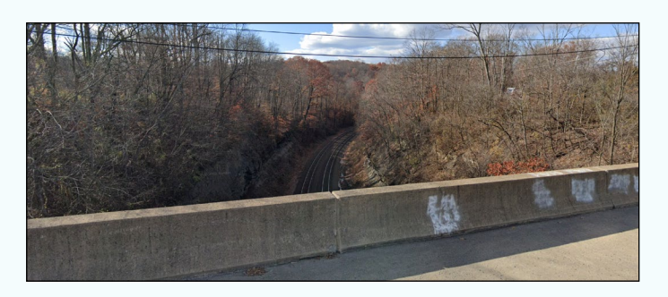
A view from Summit Cut Bridge

Also in Pennsylvania we encounter a Lady who walks the Summit Cut Bridge at Big Beaver. Some say she is a woman who took the curve too fast in her car in the late 1940's early 50's and careened off the bridge, to a woman who jumped from the bridge. She usually appears at midnight, whether to warn or to wait for another person to make that fatal turn and join her in her eternal walk.